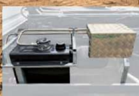
Tank + Valve